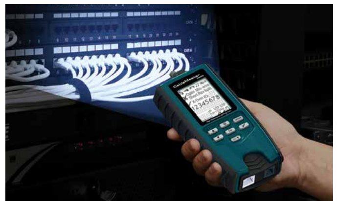
Easy to read, backlit LCD screen with large icons, glow-in-the-dark keypad and built-in LED flashlight for use in dark areas